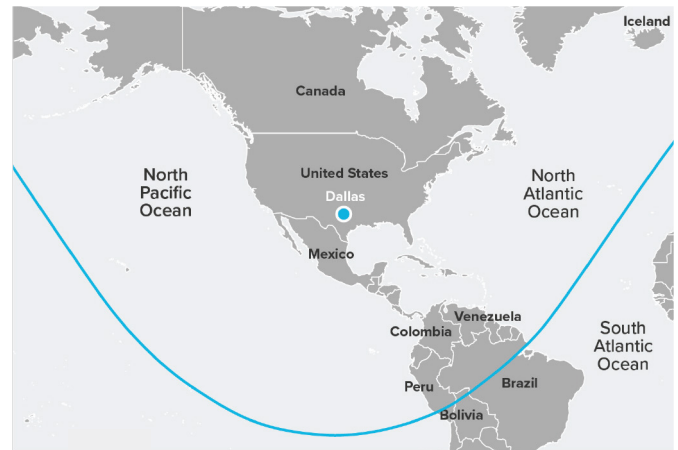
DAL: BOEING 757-200

Private Jet Services is the exclusive sales and marketing partner for the VIP Boeing 757 fleet, operated under 14CFR121 by New Pacific Airlines AOC# 7C7A855N.