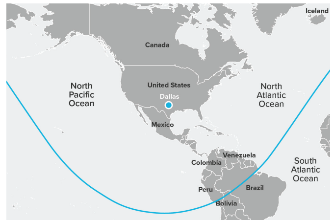
DAL: BOEING 757-200

Private Jet Services is the exclusive sales and marketing partner for the VIP Boeing 757 fleet, operated under 14CFR121 by New Pacific Airlines AOC# 7C7A855N.