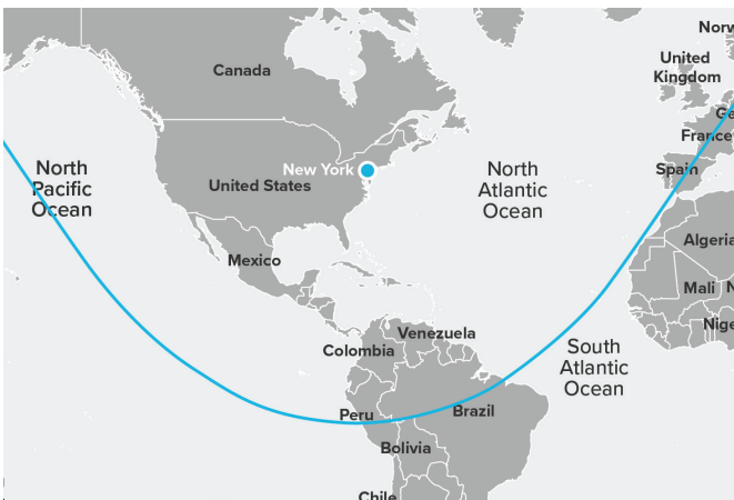
EWR: BOEING 757-200

SATELLITE WIFI KU BAND Ku-band Systems are the only systems on the market that consistently allows for streaming video and effortless browsing on multiple devices.